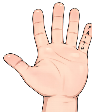
Illustration: The Key

Faith is the key that opens the door to heaven.